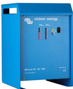
Skylla TG 24 100