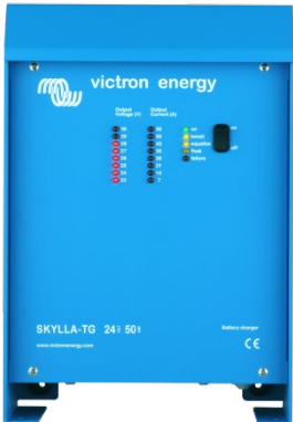
Skylla TG 24 50