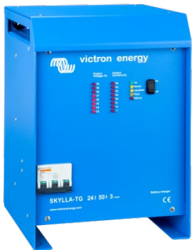
Skylla TG 24 50 3-phase

To learn more about batteries and charging batteries, please refer to our book 'Energy Unlimited' (available free of charge from Victron Energy and downloadable from www.victronenergy.com ).