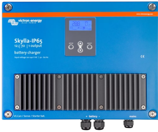
Skylla-IP65 12/70 (1+1)