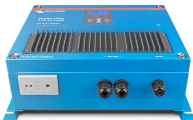
Skylla-IP65 12/70 (1+1)

To learn more about batteries and charging batteries, please refer to our book 'Energy Unlimited' (available free of charge from Victron Energy and downloadable from www.victronenergy.com ).