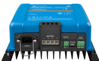
Phoenix Smart 12/50(3)