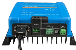
Phoenix Smart 12/50(1+1)