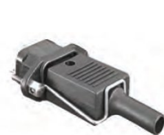
Retainer clip (included)