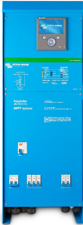
EasySolar 5 kVA