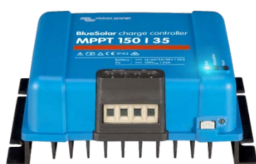
Solar Charge Controller MPPT 150/35