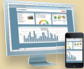
StecaGrid Portal Web portal