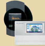
Solar-Log™ and Meteocontrol WEB'log Accessories