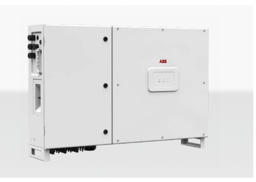
ABB string inverters PVS-50/60-TL

The PVS-50/60-TL is ABB's cloud connected three-phase string solution enabling cost efficient large decentralized photovoltaic systems for both commercial and utility applications.